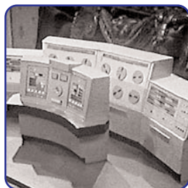
UNIT FILE: 250666/037/10 WOTAN