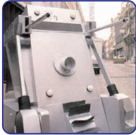
UNIT FILE: 250666/03/10 War Machine